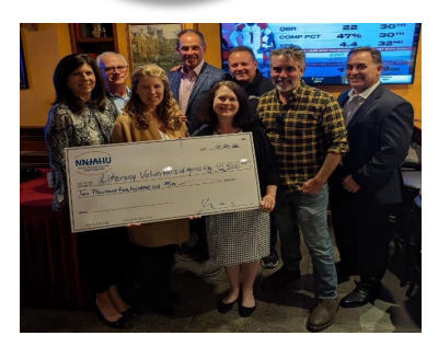
Thanks to the Northern New Jersey Association of Health Underwriters for making LVMC the beneficiary of their annual charity golf event