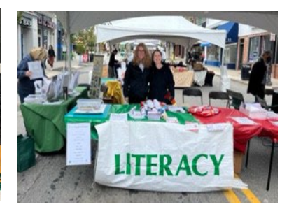
We met lots of old and new friends at the Morristown Fall Festival